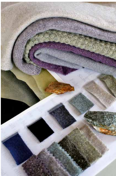
Todd & Duncan

The simple non-colour colour palette draws inspiration from desolate urban settings. Distorted and graduated shades set the mood. The natural colour palette ranges from shaded rock and soft beige through to an intense red-brown veering towards terracotta. Brown and taupe shades take on sophisticated nuances. Reds are elegant and showy, replacing orange as the key colour. Blues and cold dark steel greys or subtle shades of coal are accentuated by touches of cobalt blue and teal. There is a strong focus on saturated halftones, especially in intense forest green and muddy greens, for a look that projects nostalgia and modernity.