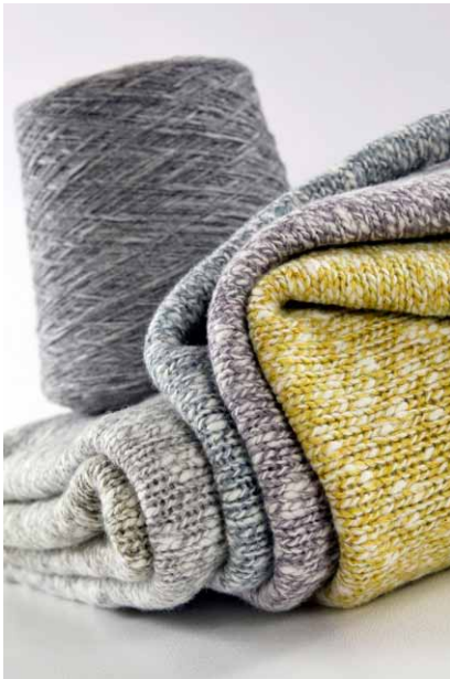
Todd & Duncan