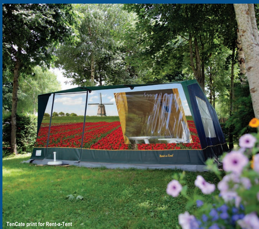
TenCate print for Rent-a-Tent

Shortly after the launch, TenCate Outdoor Fabrics announced an order for digitally finished tent and awning fabrics from Rent-a-Tent, for use in the manufacture of bungalow tents that will be rented to camping enthusiasts across Europe.