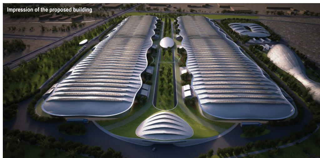
Impression of the proposed building

Textiles is a water and power intensive industry, which makes the project all the more difficult because the client's aim is to channel all waste into a circular or closed-loop system, in order to get as close to zero waste as