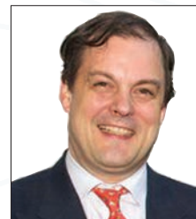
Charles Beauduin, President, CEMATEX www.cematex.com

No one will deny that the textile industry still has a long way to go in improving its overall environmental performance, but two initiatives in the Indian subcontinent – both featured in this edition of the Bulletin – show what progress can be made with commitment and collaboration. In one we describe plans for a space-age 'eco' factory, based on designs that mimic the structures of nature. In the other we report how Bangladesh plans to invest to solve its many textile related sustainability problems, but especially the efficiency of its dyeing and finishing sector.