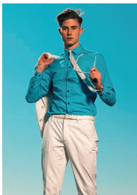
Brilliant Turquoise EC-GN

Outdated filament spinning technologies in China account for 42% of total energy consumption and CO 2 emissions but can supply only 16% of total filament production, according to data presented by Oerlikon Manmade Fibers during a round-table forum in Beijing. Oerlikon's study, 'Sustainable growth through value innovation',