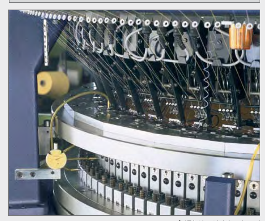
S4F348 - Knitting head