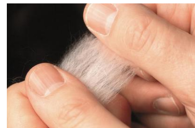
Top quality ELS cotton fibers